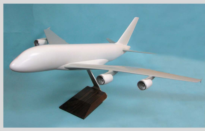
(Above) One of the first 1/100 scale A380 models made from the new tooling