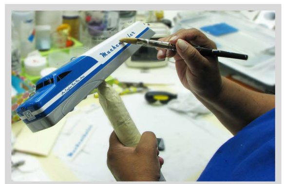
(Top) The Arts Legacy Award includes a 15" award for each year's recipient and a larger 29" award. (Top right) A 3D model is created. (Middle) A model is then produced using CNC and 3D printing technology. (Bottom right) Lastly, decals are applied. (Bottom left) The Muckenthaler exhibit at John Wayne Airport.