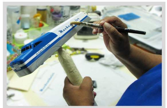
(Top) The Arts Legacy Award includes a 15" award for each year's recipient and a larger 29" award. (Top right) A 3D model is created. (Middle) A model is then produced using CNC and 3D printing technology. (Bottom right) Lastly, decals are applied. (Bottom left) The Muckenthaler exhibit at John Wayne Airport.