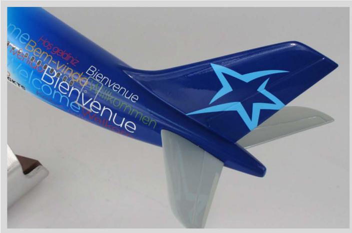
(Far right) 1/50 scale A330-200 exhibit model measuring approx. 45.5 in / 118 cm in length.