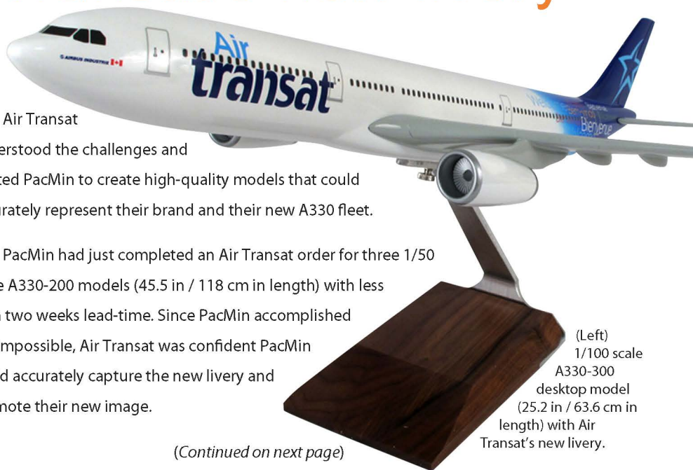
(Left) 1/100 scale A330-300 desktop model (25.2 in / 63.6 cm in length) with Air Transat's new livery.

“ We are extremely satisfied with the work provided by PacMin, we gave them a very aggressive time-line for our 25 th anniversary activities and they came through with flying colors. ”