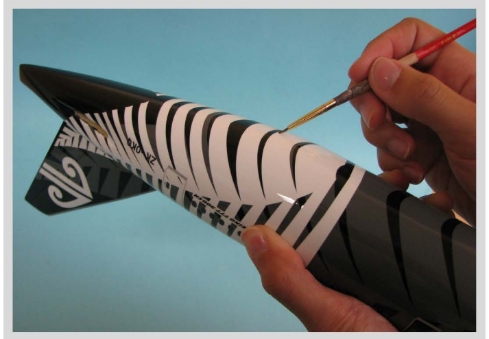
(Top) PacMin employee touching up livery decal.

PacMin's attention to detail resulted in visually dynamic models that were ready to showcase Air New Zealand's new livery. ■