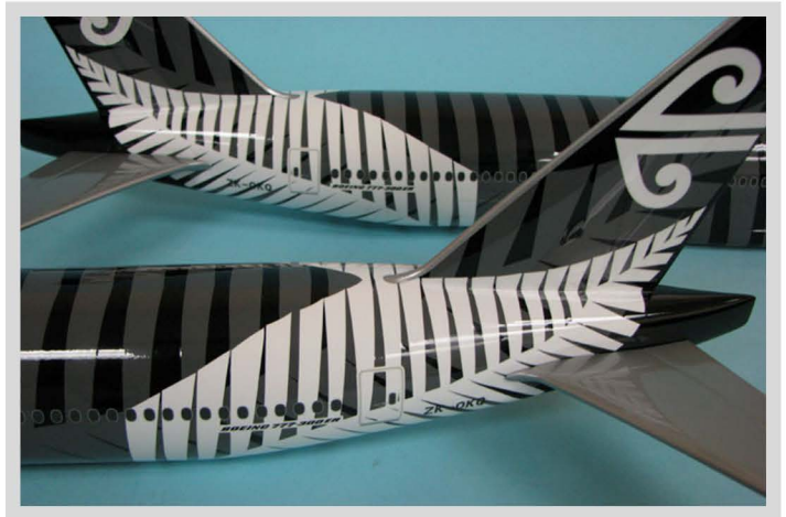
(Bottom right) Close-up of livery design after receiving touch up treatment.